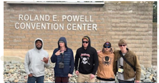
ANNUAL RECOVERY CONVENTION